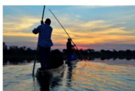
African World Heritage Day