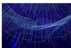
World Press Freedom Day

Here are the upcoming UNESCO International Days! Click the picture and discover exciting ways for your schools to participate!