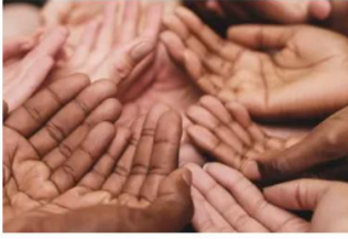
International Day of Living Together in Peace

Here are the upcoming UNESCO International Days ! Click the picture and discover exciting ways for your schools to participate!