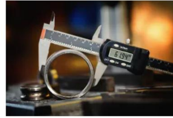
World Metrology Day