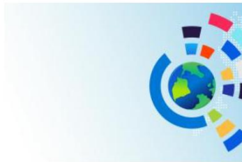
International Day for Universal Access to Information

Here are the upcoming UNESCO International days! Click the picture and discover exciting ways for your schools to participate!