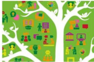
World Teachers' Day