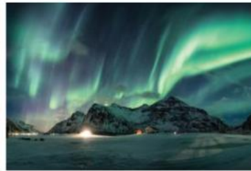
International Geodiversity Day