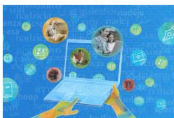
International Literacy Day

Here are upcoming UNESCO International days! Click the picture and discover exciting ways for your schools to participate!