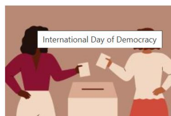
International Day of Democracy