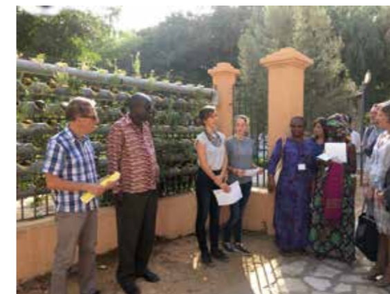
Visit to the Cours Sainte Marie de Hann School (Green wall conceived by the students)

Until the completion of the project in March 2018, all participating schools will develop their own action plans by taking advantage of their own characteristics and carry out a variety of efforts to address climate change, a global issue, at the school and community level with the keyword of “whole school approach”. In addition, they are aiming to transform how they think the school should be through learning opportunities such as exchanges and study sessions with other schools participating in the project.