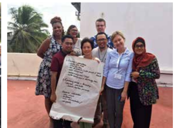
International Workshop for Facilitators held in Dakar, Republic of Senegal